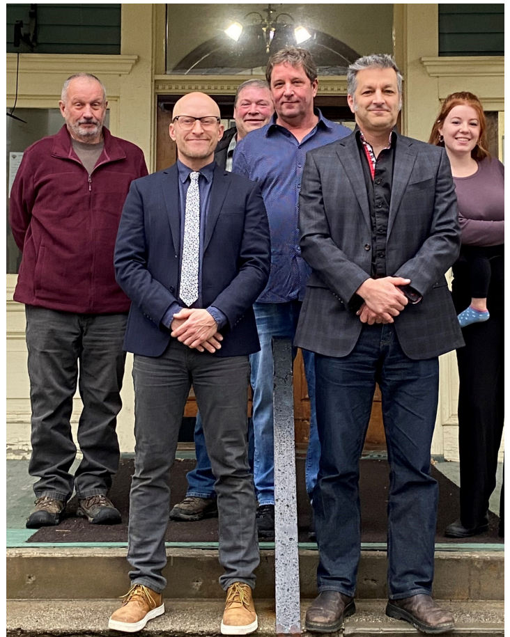
Pictured above: MLA Roly Russell, Councillor Huisman, Councillor McLean, Mayor Bolt, Councillor Rhodes & Councillor Shaw.

This project will support a healthier environment in and around Greenwood while helping mitigate new climate related challenges.