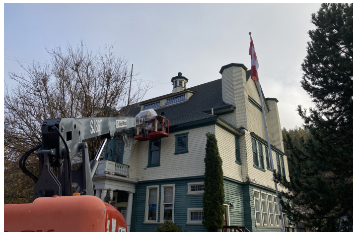
Picture Above: Greenwood City Hall undergoing the renovations during Summer/Fall 2022.

Greenwood City Hall underwent some renovations this past summer & fall of 2022. The City of Greenwood was able to obtain a Heritage BC Grant for the project. The work included removal and replacement of the fire escape and concrete slab rehabilitation of the East side foundation wall and windows. The City would like to extend a big thank you to the Ministry of Forests, Lands, Natural Resource Operations and Rural Development. Their financial support has made this project possible as part of the Community Economic Resiliency Infrastructure Program (CERIP) - Unique Heritage Infrastructure Stream. Additionally we would like to recognize Smith Bros. & Wilson (B.C) Ltd. for completing these renovations and to acknowledge their role in constructing the Greenwood Courthouse building in 1902.