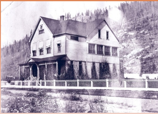
Sacred Heart Hospital