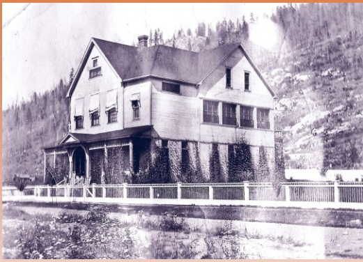
Sacred Heart Hospital 384 Marguerite Ave., Greenwood, B.C.